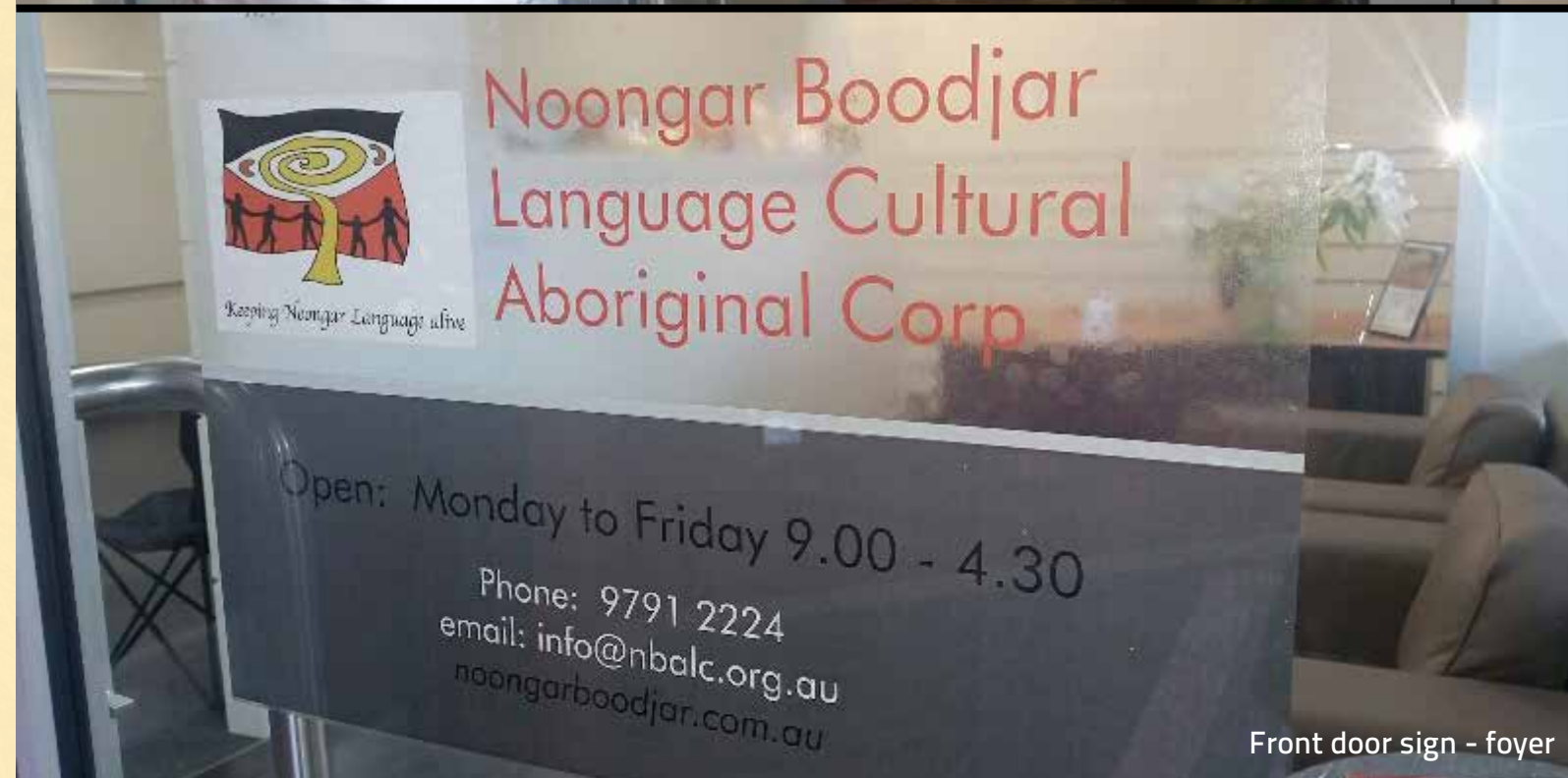
Front door sign - foyer